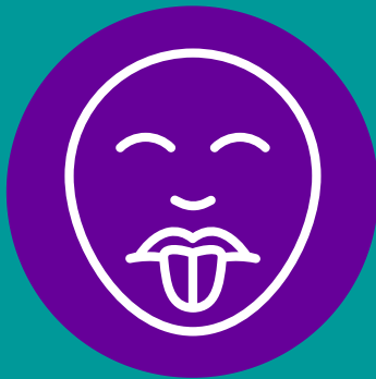
Changes in smell or taste