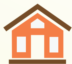
Houses with little to no AC